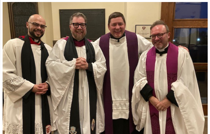
Above: SPR's Choir joined the choirs of St. John the Evangelist Episcopal Church and St. Thomas More Catholic Community for Ecumenical Lenten Evening Prayer. Here, the clergy from all three parishes gather for a photo after the service.

Each year, SPR puts on a festive reception after the Easter Vigil, and we need your help! Mostly to put out wine/food/etc. and provide hospitality as we welcome members and friends. If you would like to help, please send your name to the office and we will get you all squared away: office@stpaulref.org .