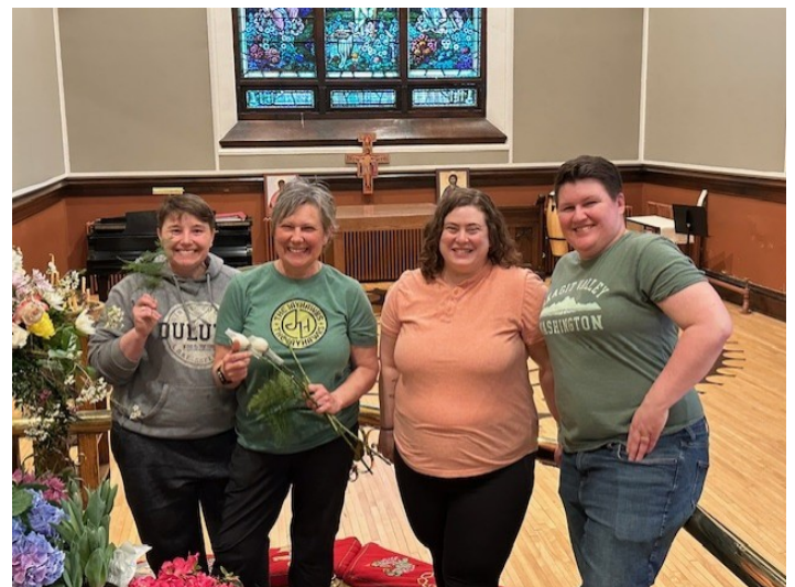
Above: It takes an army (literally, people who are in the army) to arrange the flowers for Easter. Here, a fine looking crew lend their expertise to SPR's Easter decorations!

ISAIAH UPDATE + ISAIAH kicked off a Deep Listening Campaign via forums the last three Sundays in March. There was a large number of participants who expressed their concerns about how they or their loved ones are being affected by the current political reality. A survey was used to stimulate people's thoughts. Small groups allowed people to express those pains more deeply. The goal is to increase the number of people who take the survey to more fully represent the congregation. The results of this will be communicated in early May. Please consider participating if asked. Longer term, the survey results will be combined with those of the other ISAIAH congregations in St. Paul and the East Metro.