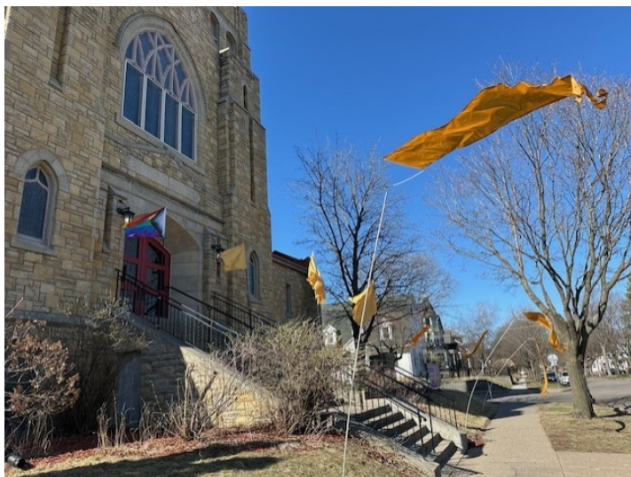
Above: SPR's banners were flying high for Easter, while the wind of the Holy Spirit was...blowing!