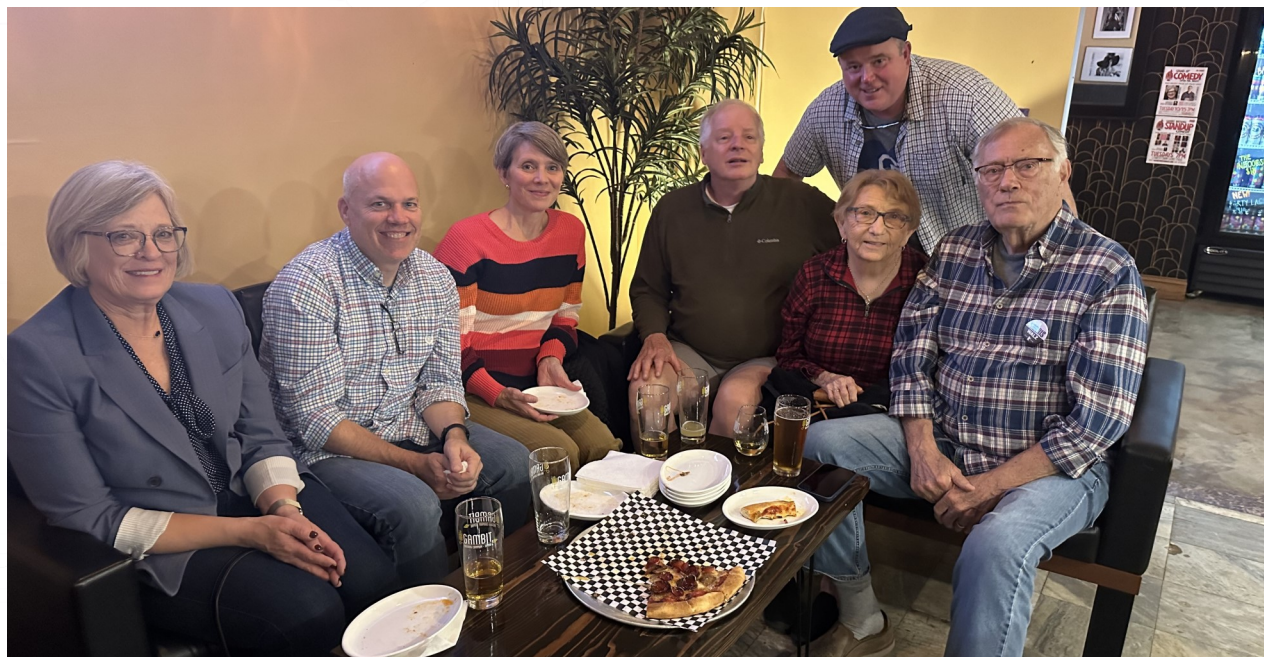
Above: SPR's "Theology on Tap" gathered at Gambit Brewing in St. Paul to discuss all things divine. Most notably, the music of 80's Hair Bands was playing in the background, perhaps a sign from heaven. Theology on Tap meets again in January!

The Spectrum items, articles and columns need to be to the Parish Office by the 12th of the month. The Spectrum goes to print on the 15th and this date is hard and fast. Articles received after the 12th may or may not be included.